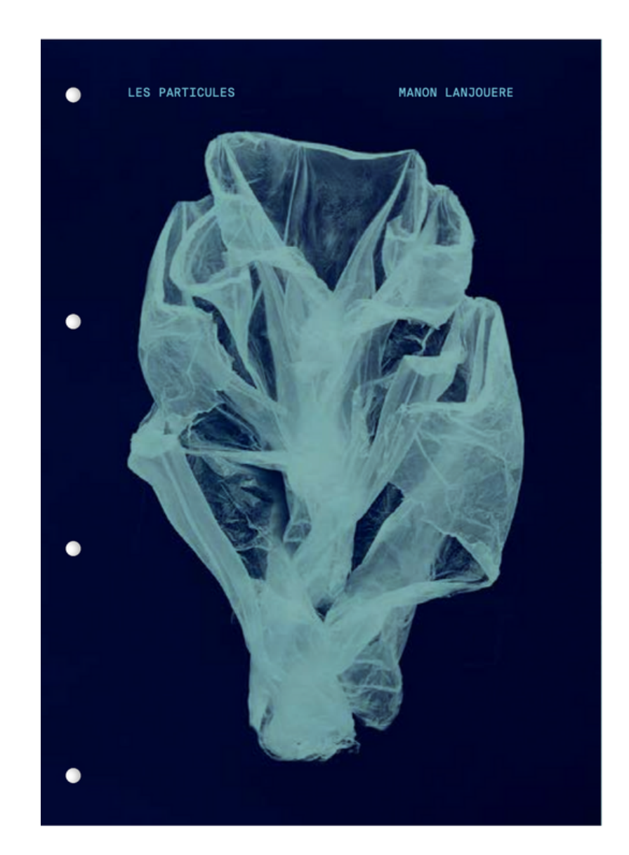
Les Particules, Collection Civis Maritimus

This book was supported by the Conseil Régional Ile-de-France and the Fonds de dotation agnes b.